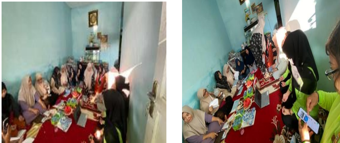
Figure 3 Autogenic Relaxation Therapy Activity

The goal itself at the end of the activity process, it is hoped that people who suffer from hypertension on merawan road 20 rt.26 rw.07 no.82 sawah lebar village, ratu agung sub-district, Bengkulu city can find out about autogenic relaxation therapy and can demonstrate it. The benefit of this activity is that people suffering from hypertension can benefit from the knowledge gained during counseling and make a new routine that should be done at home related to this autogenic relaxation therapy.