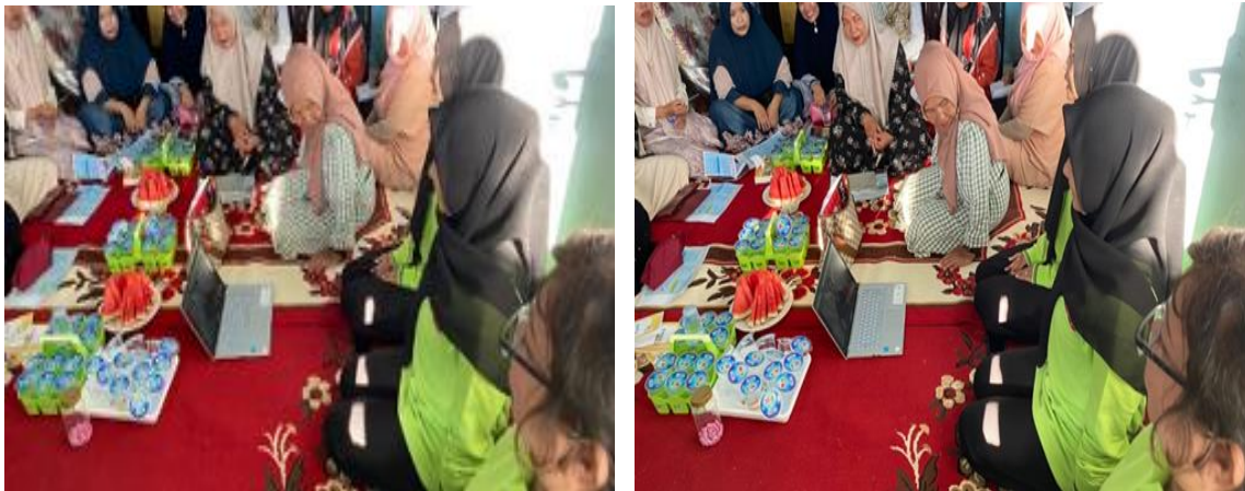
Figure 2 Progressive Muscle Relaxation Meditation Therapy Activity

The goal itself at the end of the activity process, it is hoped that people suffering from hypertension on merawan road 20 rt.26 rw.07 no.82 sawah lebar village, ratu agung sub-district, Bengkulu city can find out about progressive muscle relaxation meditation therapy and can demonstrate it. The benefit of this activity is that people suffering from hypertension can benefit from the knowledge gained during counseling and make a new routine that should be done at home regarding this progressive muscle relaxation meditation therapy.