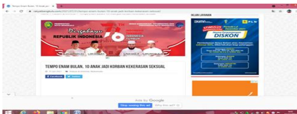
Figure 1 Mass Media