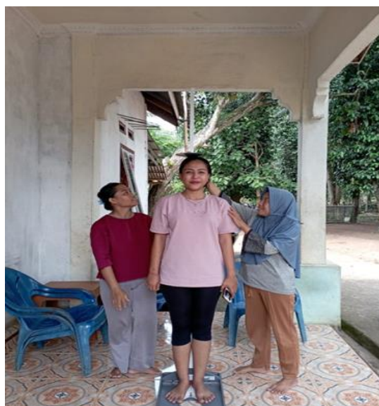
Figure 2 Documentation Of The Process Of Measuring Catin's Height And Weight

"When providing assistance to prospective brides (catin) we already have tools such as measuring height, weight, and a special book for recording the results of temporary examinations by the TPK, checking the weight, height, and upper arm circumference of the catin."